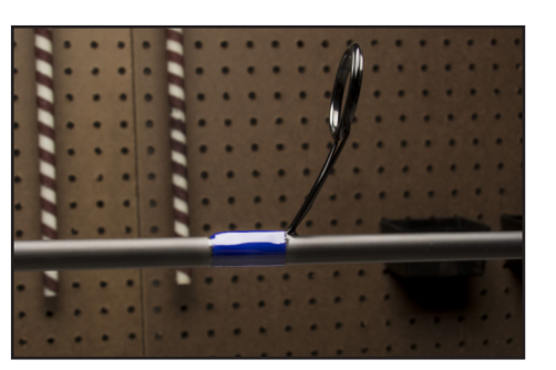
PRO TIP: Never apply heat directly to the epoxy as too much will create more bubbles or harm components.

ProKöte will be fully cured and ready for use after a full 24 hours. If your build requires a second coat, apply it after 24 hours, but is not recommended any longer than 5 days after the first coat.