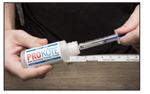
PRO TIP: Withdraw and inject epoxy slowly with syringes to avoid adding air bubbles.

Stir epoxy together for at least 5 minutes to get proper mix.